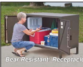
Bear Resistant: Receptacles, Lockers, IGBC Certified.