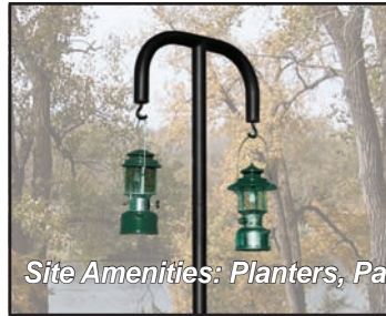
Site Amenities: Planters, Parking Bollards, Lantern Poles