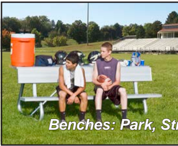
Benches: Park, Streetscape, Athletic.