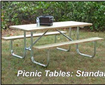
Picnic Tables: Standard, Accessible, Kid Size.