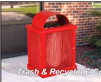
Trash & Recycling: Containers, Lids, Liners.