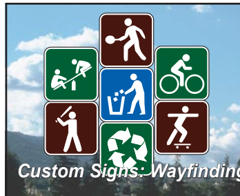
Custom Signs: Wayfinding, Banners, Plaques, Decals