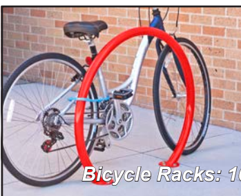
Bicycle Racks: 10 Different Styles.