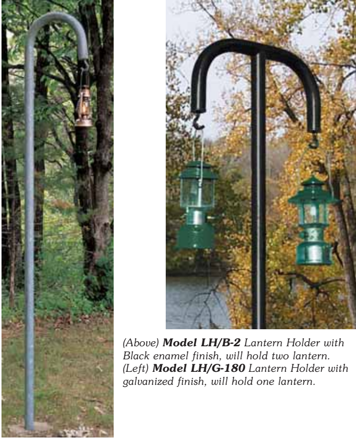
(Above) Model LH/B-2 Lantern Holder with Black enamel finish, will hold two lantern. (Left) Model LH/G-180 Lantern Holder with galvanized finish, will hold one lantern.