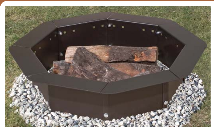
Model IO-30/8 Octa-Ring Campfire Ring as a stand-alone firering.