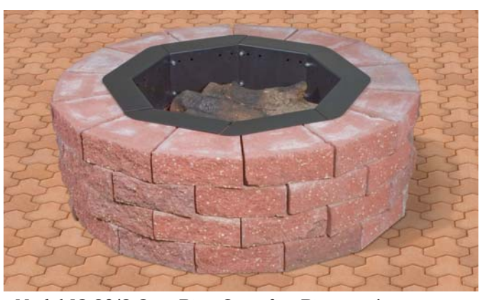
Model IO-30/8 Octa-Ring Campfire Ring as a firering insert used with landscaping stone (sold separately).