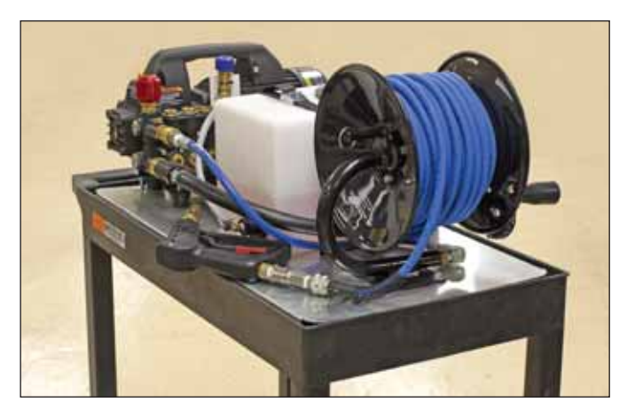
Model DMS-TNT350 Complete Disinfectant Misting System shown with optional Model DMS-CART1630 utility cart.