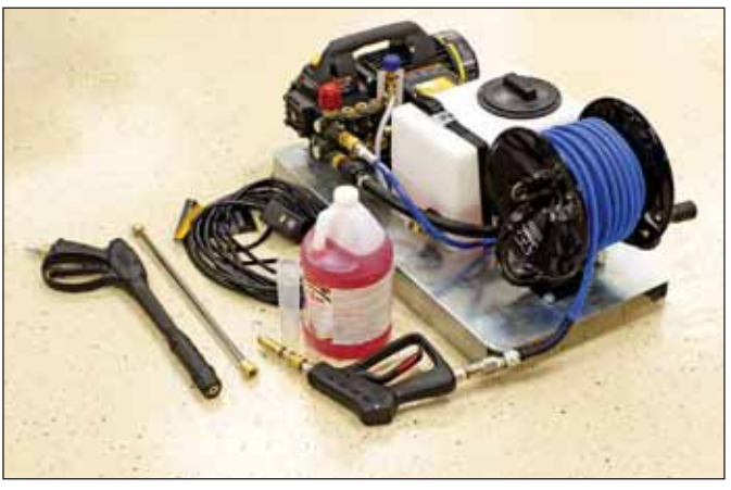
Model DMS-TNT350 Complete Disinfectant Misting System with pregalvanized steel base plate. No assembly required. Made in the USA.