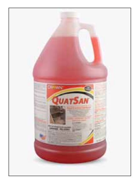
Model DMS-QUATSAN disinfectant 1 gallon bottle (shown).