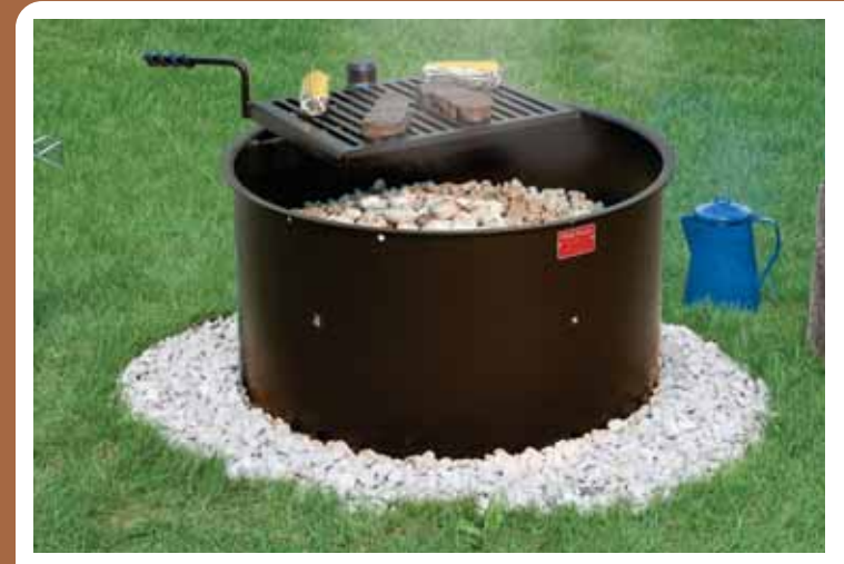
Model FSW/SL-30/18/PA Wheelchair Accessible Campfire Ring with snow load rated swivel cooking grate.

SPECIFICATION BULLETIN #SPC-FR-090 REV. 05-20