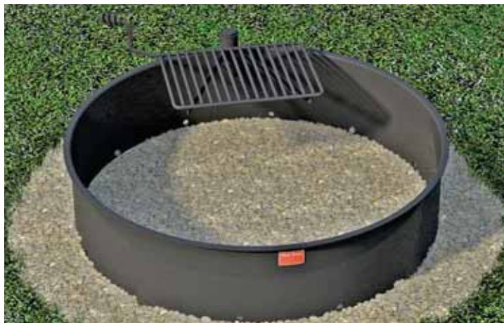
Model FSW-48/11/PA Campfire Ring with swivel cooking grate.

(Below) Grate shown rotated out of the firering.