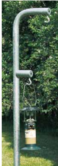
(Above) Model LH/G-1A Lantern Holder with galvanized finish and welded-on Wheelchair Accessible Hook. (Left) Model LH/G-1 Lantern Holder with galvanized finish.