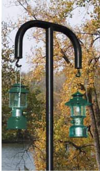
(Above) Model LH/B-2 Lantern Holder with Black enamel finish, will hold two lantern. (Left) Model LH/G-180 Lantern Holder with galvanized finish, will hold one lantern.