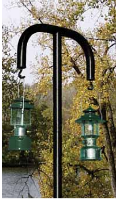
(Above) Model LH/B-2 Lantern Holder with Black enamel finish, will hold two lantern. (Left) Model LH/G-180 Lantern Holder with galvanized finish, will hold one lantern.