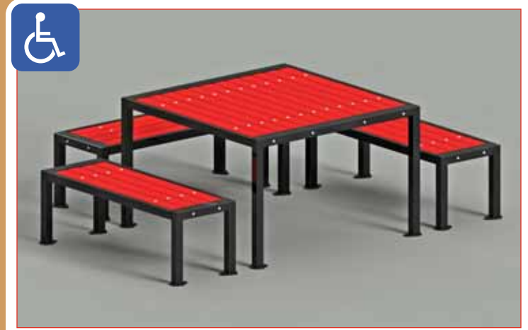
Model TQ703/CB-4PR surface mount wheelchair accessible square frame table with black powder coated frames, 4 ft. square with red recycled plastic top and seats.