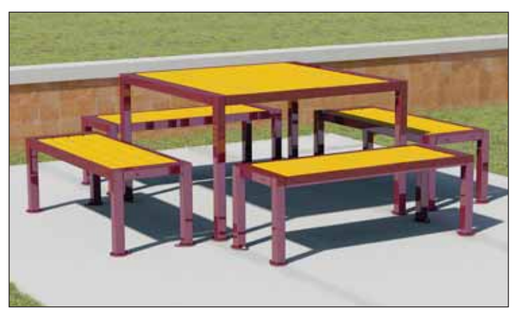
Model TQ704/CE-4PY surface mount 4 ft. square frame picnic table with burgundy powder coated frames and yellow recycled plastic top and seats.